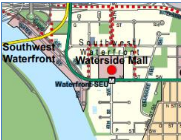
Figure 3. Comprehensive Plan Generalized Policy Map for Near Southwest